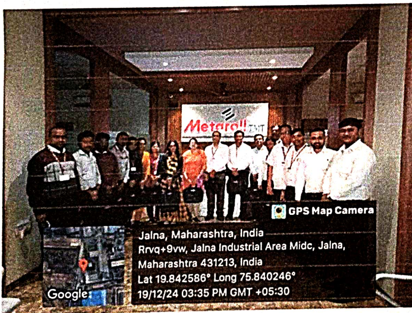
Metarolls Ispat Private Limited