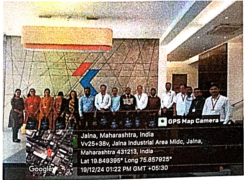
Kalika Steel Alloys Pvt Ltd