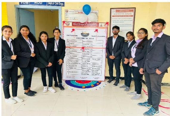
CESA Body 2023-24