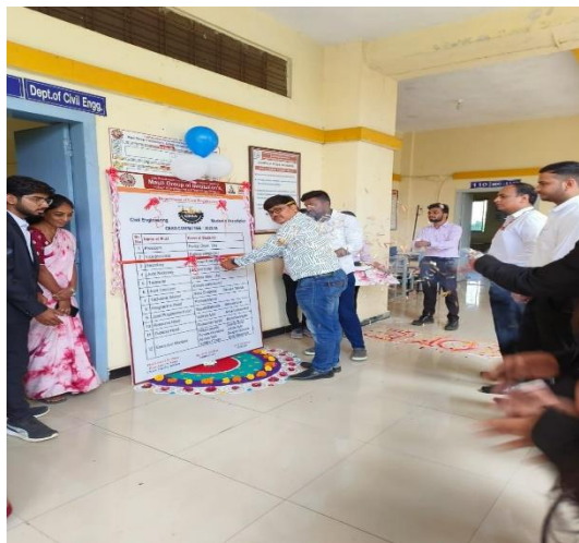
Chief Guest Inaugurating CESA Body