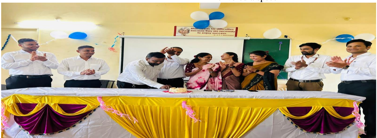
Respected HOD Sir and All Dear Faculties of Civil Department