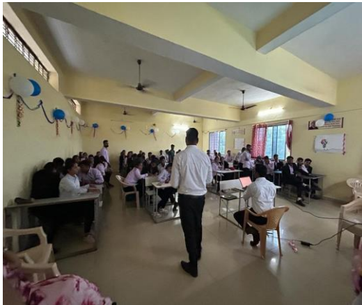
Observation Test Competition