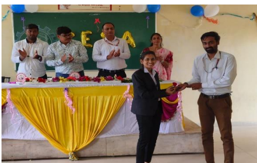
Facilitation Of CESA Body By faculty