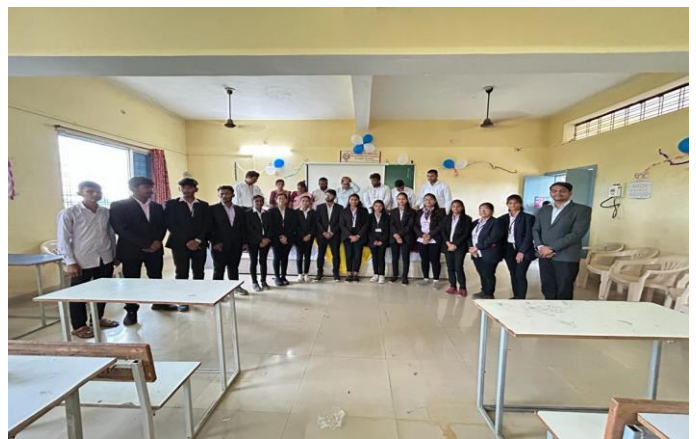
All Teaching Faculties with Respected Chief Guest