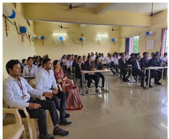
Participants present in the Event