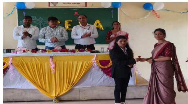
Facilitation Of CESA Body By faculty