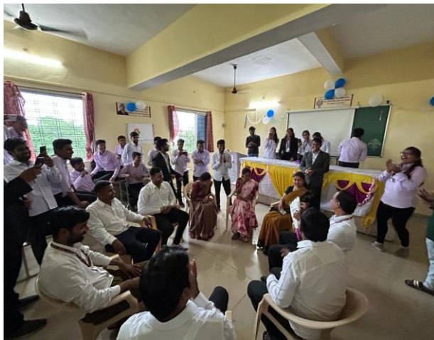
Faculty Programme Arrange by Student