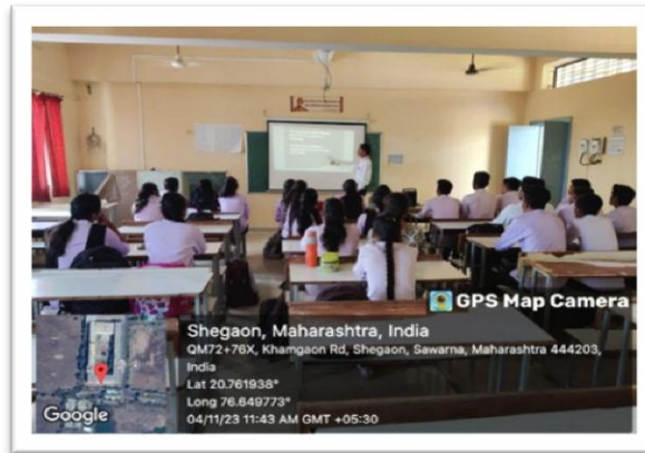
Photo of SMART Classroom & ICT Facilities